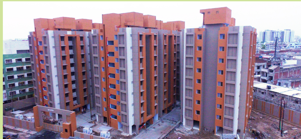
Houses constructed under AHP, Surat, Gujarat

A beneficiary will be eligible for availing only a single benefit under any of the existing options i.e. Slum Redevelopment with Private Partner, Credit Linked Subsidy, Direct Subsidy to Individual Beneficiary and Affordable Housing in Partnership. It will be the responsibility of States/UTs Government to ensure that the beneficiary is not given benefit under more than one component of the Mission.