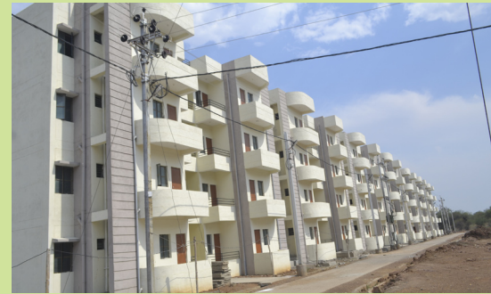
AHP under PMAY (U) in Pendri, Rajnandgaon, Chattisgarh